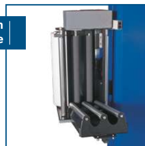
Power Pre-Stretch Carriage