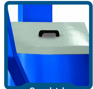
Completely Steel Made