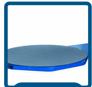
Up to Ø 3400 mm Turntable